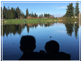
BRADLEY LAKE PARK