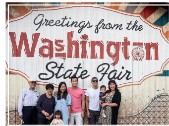
WASHINGTON STATE FAIR