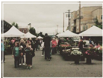
PUYALLUP FARMERS MARKET