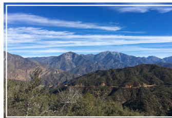
GLENDORA MOUNTAIN ROAD