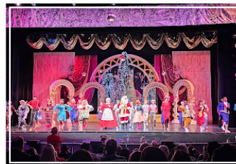
HAUGH PERFORMING ARTS CENTER