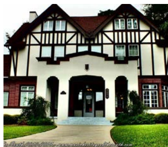
THE ALLMAN BROTHERS BAND MUSEUM