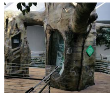
MUSEUM OF ARTS AND SCIENCES