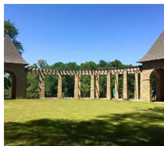
AMERSON RIVER PARK