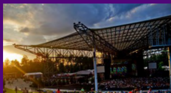
AMERIS BANK AMPHITHEATRE