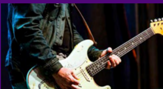
ALPHARETTA MUSIC CITY

Located just 22 miles north of Atlanta, Alpharetta is a family friendly destination with over 250 shops within a five-mile radius and more than 200 dining options. There are always things to do in Alpharetta. Here are just a few attractions: