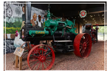
MUSEUM OF EAST ALABAMA