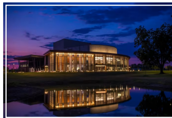
GOGUE PERFORMING ARTS CENTER