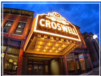
THE CROSWELL OPERA HOUSE