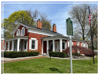
LENAWEE COUNTY HISTORICAL MUSEUM