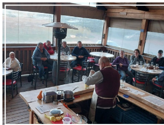
FLYING OTTER VINEYARD