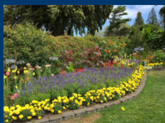
POINT DEFIANCE PARK