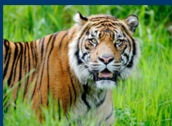
POINT DEFIANCE ZOO & AQUARIUM