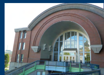
WASHINGTON STATE HISTORY MUSEUM