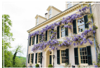
HAGLEY MUSEUM AND LIBRARY