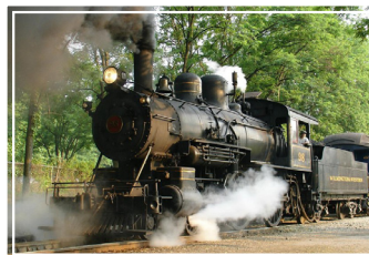
WILMINGTON AND WESTERN RAILROAD